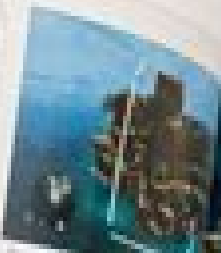
The ship is a really important part of the game. It's what makes the game so special. You can see the ships from a distance, and you can see the crew members on the deck. It's a really immersive experience.