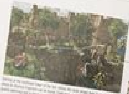
The island of Nassau is a beautiful place to visit. It's a real challenge to find, but it's worth the effort. You can see the ships from a distance, and you can see the crew members on the deck. It's a really immersive experience.

...the most important part of the game is the naval combat. It's a real challenge, and it's what makes the game so special. You can see the ships from a distance, and you can see the crew members on the deck. It's a really immersive experience.