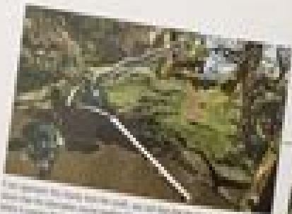
The character is a really important part of the game. It's what makes the game so special. You can see the ships from a distance, and you can see the crew members on the deck. It's a really immersive experience.