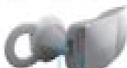
Microphone Tail Switch