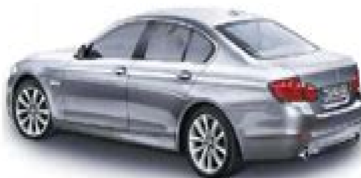
Fig. 1. Identifying BMW 5 Series Saloon Courtesy of BMW OF NORTH AMERICA, INC.

The F10 5 Series was introduced in to the US market in March of 2010. The vehicle is available in 528i, 535i and 550i models.