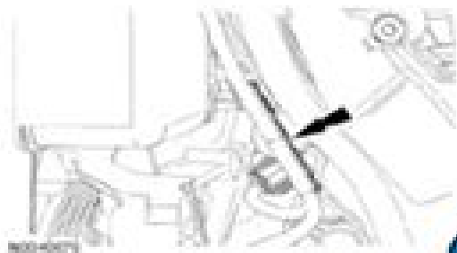
Fig. 10: Locating Electrical Connector Pin-Type Retainer

Detach the electrical connector pin-type retainer.