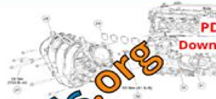
Fig. 8: Identifying Tightening Sequence Of Lower Intake Manifold Bolts Courtesy of FORD MOTOR CO.