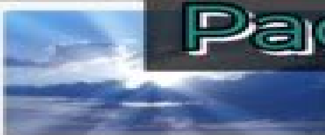
Unit 4: Nuclear Reactions