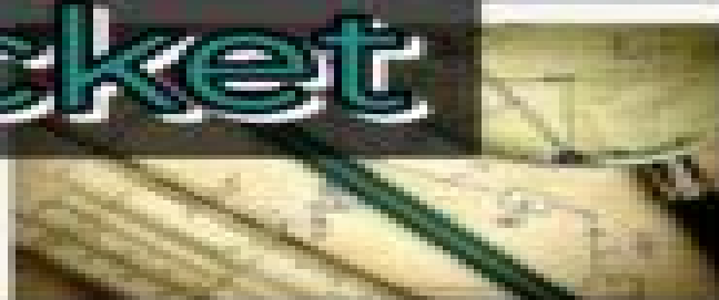
Unit 5: Semester Wrap-Up