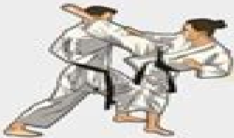
Mixed martial arts