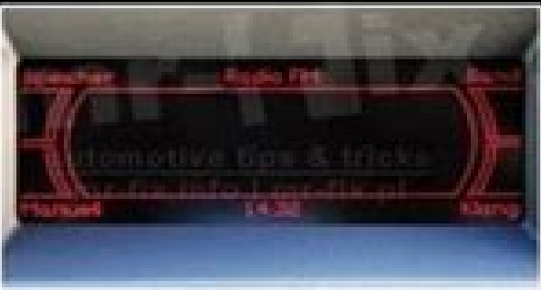
MMI 2G LOW/BASIC