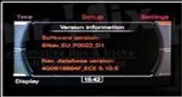
MMI 3G LOW/BASIC