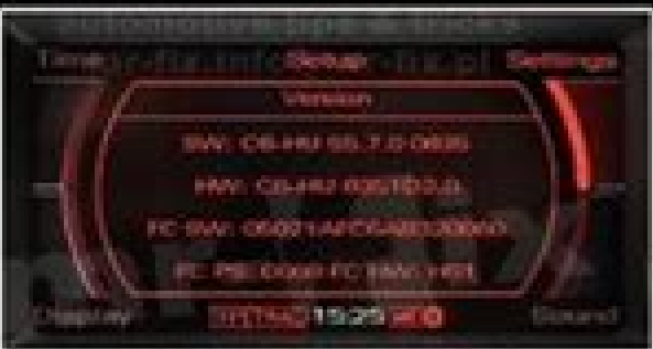
MMI 2G HIGH