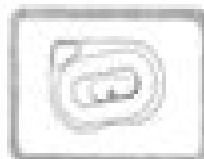
Oil Seal Kit

See Transmission Assembly Manual for Part Numbers