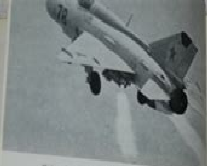
De MiG-17 is een van de meest geavanceerde vliegtuigen die nu in gebruik zijn. Het is een van de meest geavanceerde vliegtuigen die nu in gebruik zijn. Het is een van de meest geavanceerde vliegtuigen die nu in gebruik zijn.