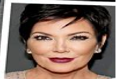
HOW KRIS REACTED

Fed up with being bullied, Jenner reveals all in a shocking new interview