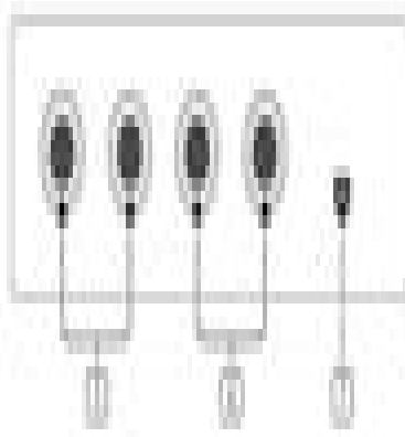
Fig. 12 Rear panel (right)