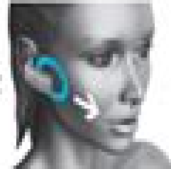
Wig, Stretch, Secure

Jawbone ICON works regardless of position, but you will get the best performance if the Icon Airway feature physically secures your eardrum.