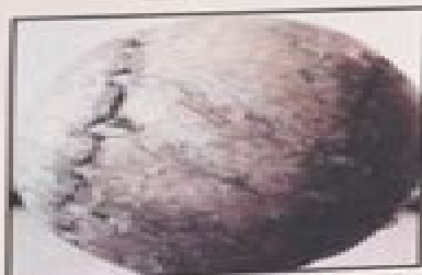
Circa: 1840's Feather Ball Picture shows stitches