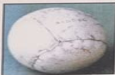
Rare Saddle Feather Ball Circa: 1840's