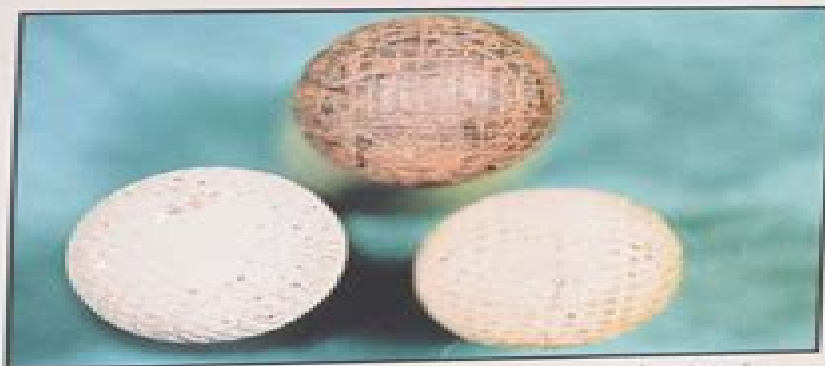
Three Moulded Gutta Balls. Top one is a red painted Winter ball Circa: 1890's