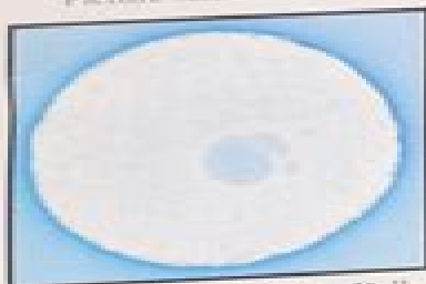
X-Ray photo of Gutty Ball. Dark spots are air pockets