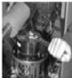
Figure 6-8: Remove Bolts the Top