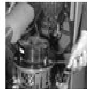
Figure 6-12: Remove Brake Housing Cover