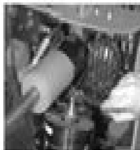
Figure 6-7: Remove Bolts the Top