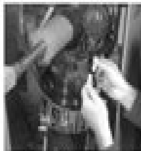
Figure 6-9: Disconnect Brake Wiring Harness