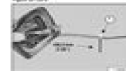
Insert the boom cylinder pin into the boom cylinder.