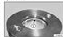
Remove the bolt and nut from the boom cylinder.