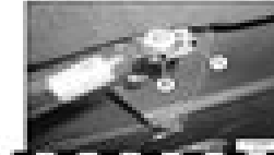
Insert the boom cylinder pin into the boom cylinder.