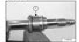
Insert the boom cylinder pin into the boom cylinder.