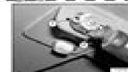
Insert the boom cylinder pin into the boom cylinder.